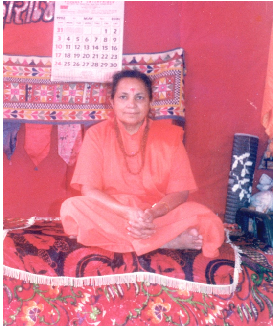
1992 Kumbha Mela