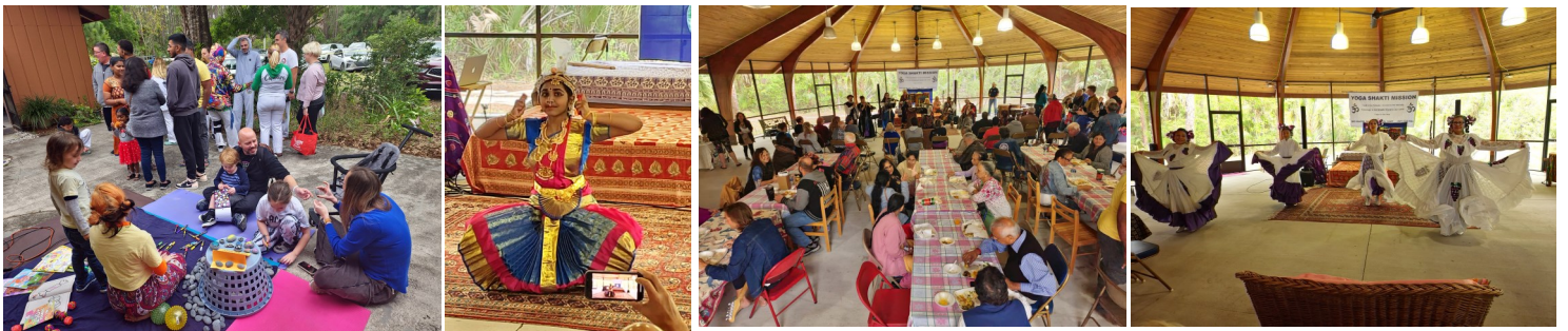
Assorted photos from past Friends of the World Gatherings

Our annual event to celebrate "World is our Family". Held in the beautiful screened in pavilion at Yoga Shakti Mission at 3895 Hield Rd. in Palm Bay, FL. There will be lots of entertainment with dance and music performed from around the world. The event is free. There will be a charge for food served. Please call 321-725-4024 if you are interested in performing or having a booth.