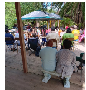
Kartik Kirtan Nov 10th